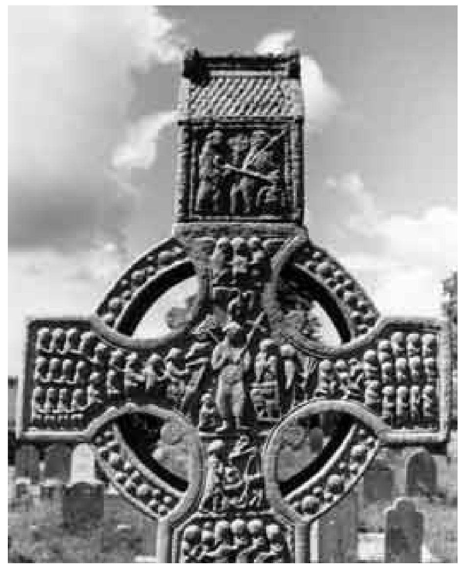
PL 7. Muiredach's Cross Monasterboice, Co Louth, east face

The contrast between harpist and piper also finds expression in early Irish society, where reed pipes are first mentioned in 8th century texts. The only musician with independent legal status among a king's entertainers was the harpist, with the piper classified among the lower grades of entertainer. If the stone sculptures were intended for a general audience the suggested role of musical instruments as symbols of good and evil would have been widely understood.