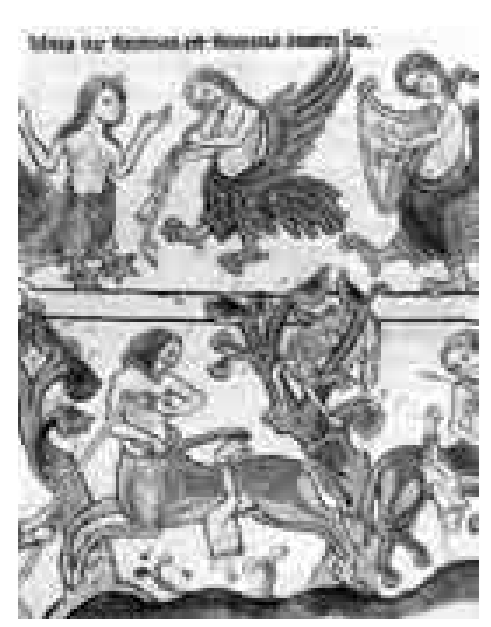
PI 6. English Bestiary from Canterbury (Bodleian Library, University of Oxford, MS Bodl 602, fol 10r).

in the Sardinia Bronze Age (7-11th century BC) and their arrival in Ireland or Scotland (8-10th century AD).