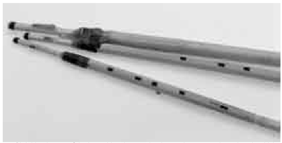
PI 4. Mouthpiece of the launeddas showing the three split cane reeds, each with a blob of tuning wax. When played, all three reeds are held inside the mouth.

(12th century) and one Spanish (13th century) manuscript. This leaves a large gap in both time and distance between the first known appearance of the pipes