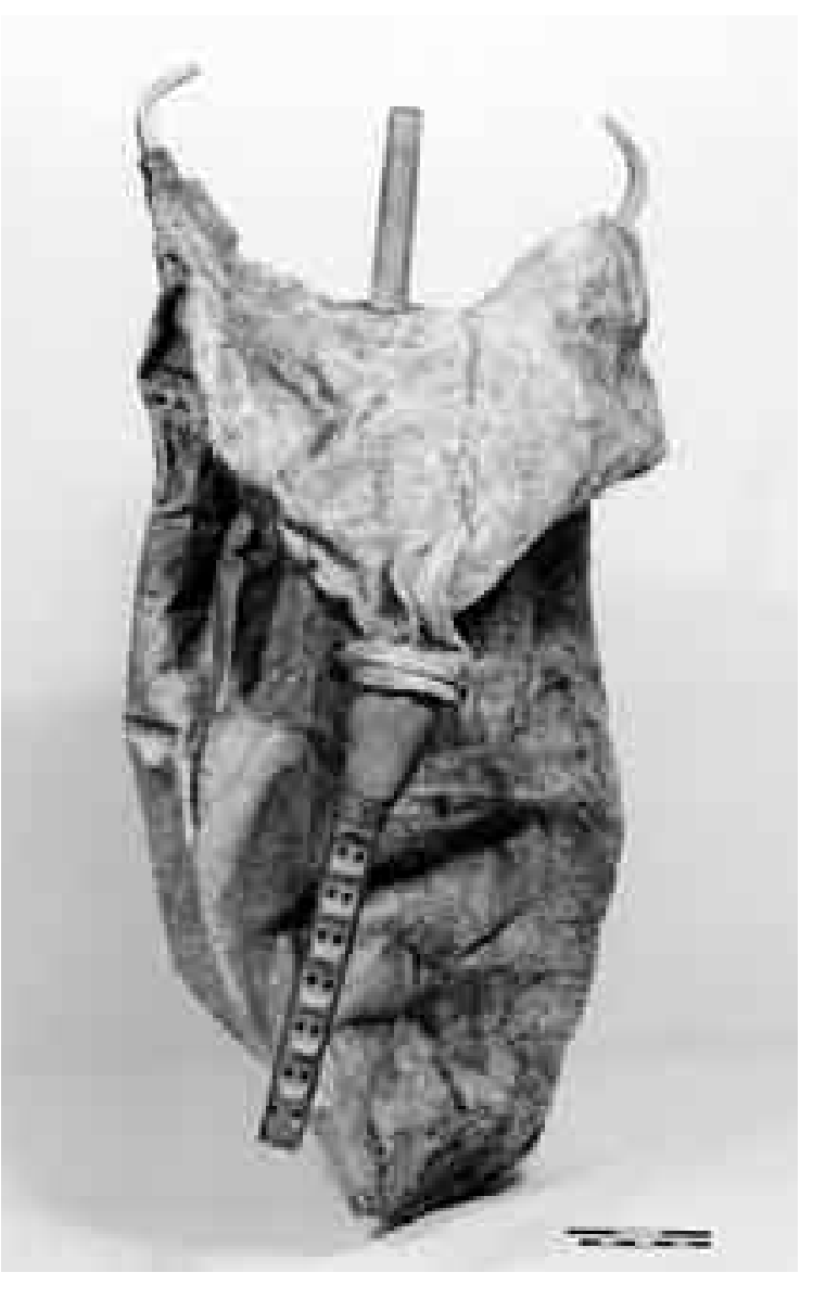
Pl 8 Bagpipe, Jayce, Bosnia (Pitt Rivers Museum, University of Oxford).

The purpose of the bag was to hold a large volume of air which was toppedup by blowing into it, making the pipes easier to play. Bagpipes were certainly known to the Romans from the first century AD. To a large extent, evidence for the bagpipe disappears until the 11th-12th century, when it is mentioned in Arabic and European sources. From the 13th century, when the drone is first referred to, the bagpipe is more frequently illustrated. If the image on the 'Cross of the Scriptures' is a bagpipe, it is in keeping with the expected evolution of the instrument - a droneless primitive bag and chanter. This would pre-date by many centuries the first illustration of a bagpipe in Ireland and would be the earliest representation of a bagpipe in