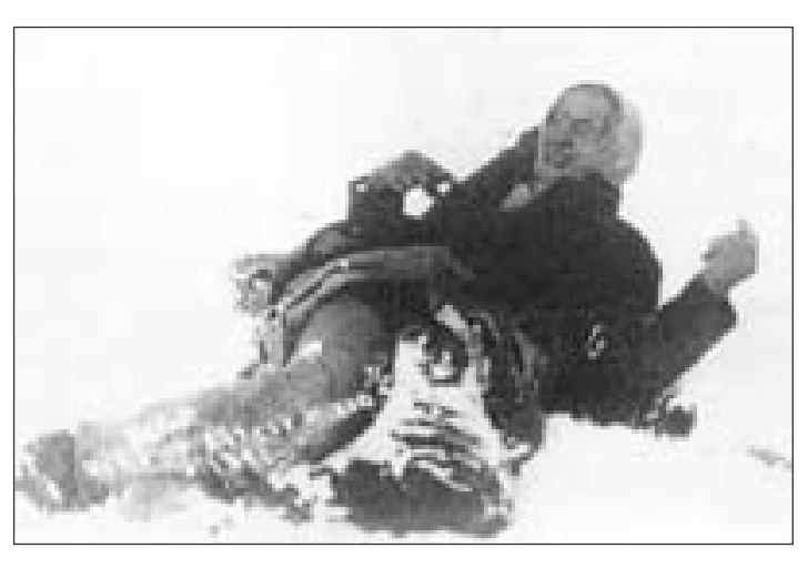
Chief Big Foot pictured as he lay frozen in the snow after the 'Battle of Wounded Knee'

Roosevelt sealed his men's legendary status with his colourful depiction of