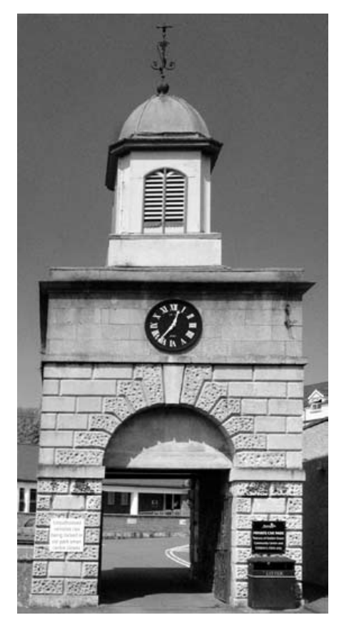
The Clock tower and gate is all that remains of the Linen Hall

body was in theory open to all Armagh's citizens. Over time many of the burgesses no longer resided in Armagh and gradually Freemen ceased to be made. Eventually entitlement to membership of the Corporation Grand Jury merely on grounds of inhabitancy became the accepted custom. It was modelled on Grand Juries of Courts Leet that acted for manors and the Sovereign selected members in the same way. However unlike its manorial templates the Corporation Grand Jury was never recognised by Act of Parliament.